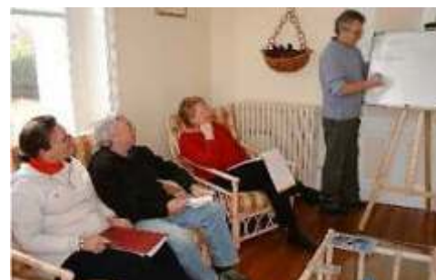
Emphasis on participation

We are well equipped with all the facilities necessary to make your stay both successful and comfortable.