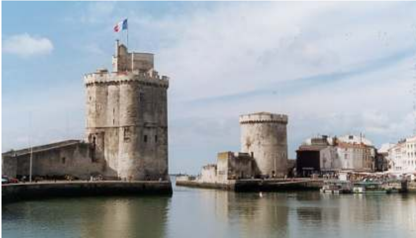
Towers guarding the Old Harbour at La Rochelle, once a major naval port and now a popular place to visit with waterfront restaurants alongside narrow streets brimming with shops