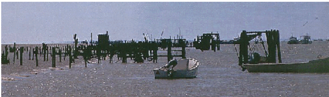
Mussel farm at Charron, on the Atlantic coastline