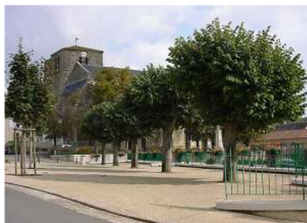
The neighbouring village of Mouilleron-en-Pareds has a pretty square alongside the church, and is overlooked by the remains of a group of windmills