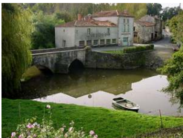
Ancient bridges and The Tower of Melusine at Vouvant, said by many to be one of the most attractive villages in France

Arrangements can be made for a tour of the local area at additional cost, if required