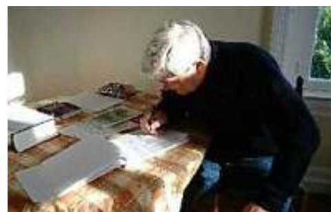
Time for private study!