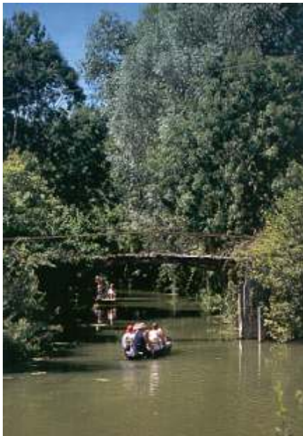
Boating in the green canals and rivers of the Marais Poitevin. There are many beautiful sights and picturesque villages along the waterways