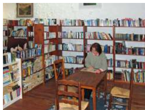
The library is well stocked with useful books and information