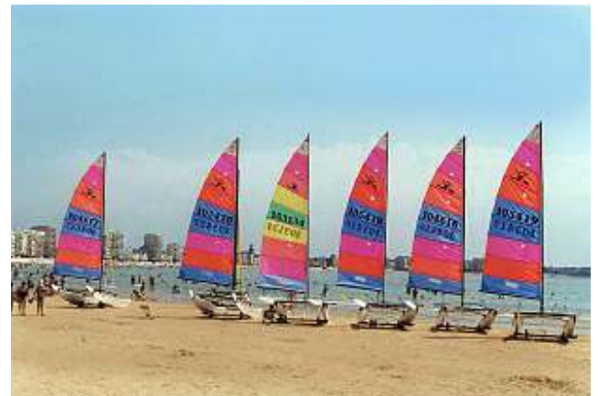
The beach at Les Sables d'Olonne